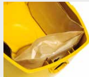
Paper filter bag