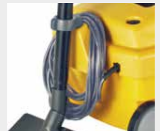
New fixing system